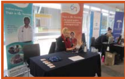
The NTGPE RUSC Program booth

Once again the Northern Territory proved to be a favourite hot spot for medical student placements as they flocked around the booth inquiring about how they could get a placement with NTGPE or to let us know that they already have a placement with us and cannot wait to get up here. Students from Canada, New Zealand, Indonesia and of course universities in Australia have shown great interest in a RUSC placement in the NT. NTGPE has an intake of 220 placements a year and with the growing interest, students need to apply 12 months in advance. The 2012 Global Health conference will be held in Cairns.