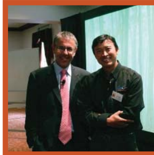
At the 1st National Indigenous Health Workforce forum in Perth, with well known & medically qualified journalist Dr Norman Swan