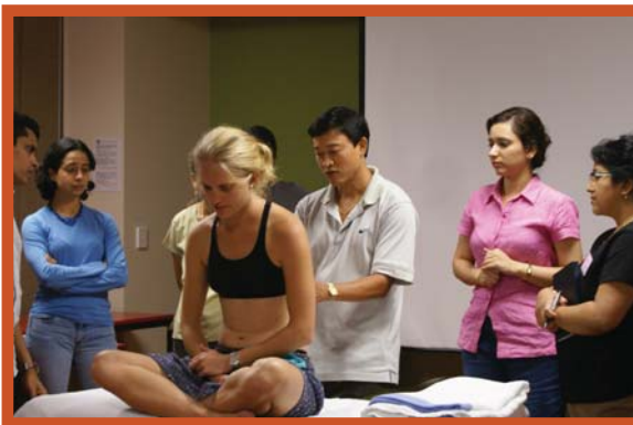
Training International Medical Graduates

Just that I am extremely grateful to all the staff at NTGPE – old and new - for supporting the DMCE role when it was first developed and I was appointed to it. I am grateful for the support that enabled me to develop the role and I am extremely grateful for the hard work of the GP supervisors and clinic staff to our learners in the NT.