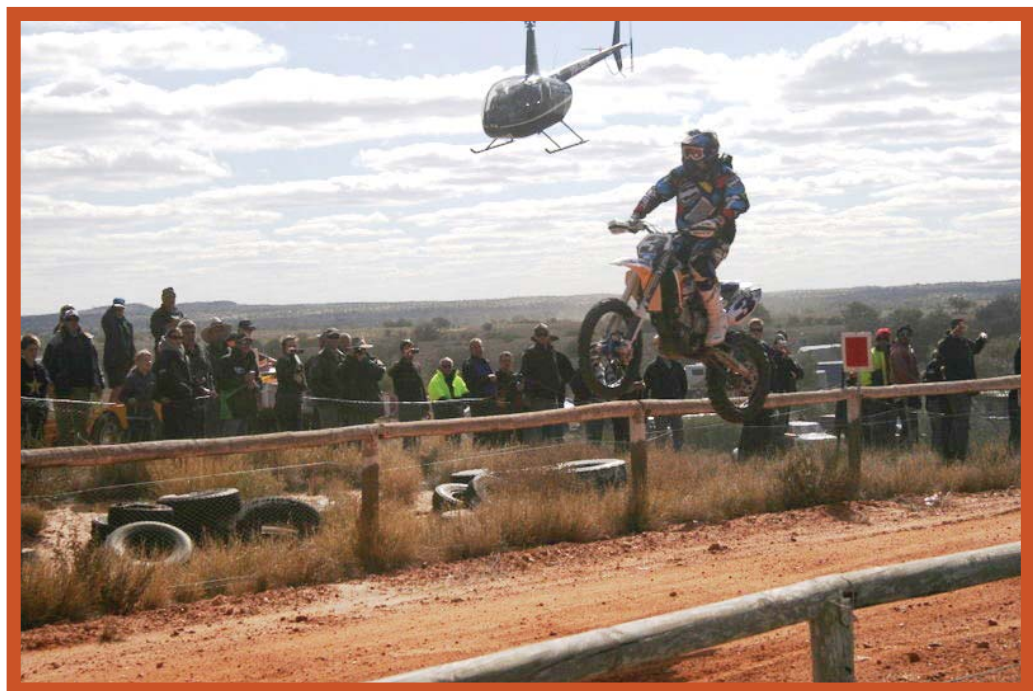
One of the more than 500 bikes (along with 70 buggies) at the Finke Desert Race in June speeding through bumpy, dusty tracks that provided many casualties for the community clinic.

Within Finke's remote health clinic I have been able to work on the forefront of