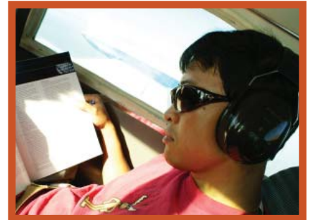
Catching up with reading during a light plane flight to East Arnhem in 2007